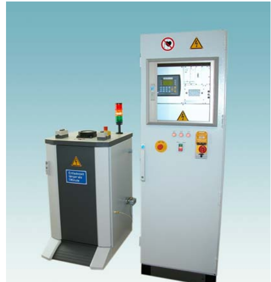
UKI-MPHP 8000 with manual handling system