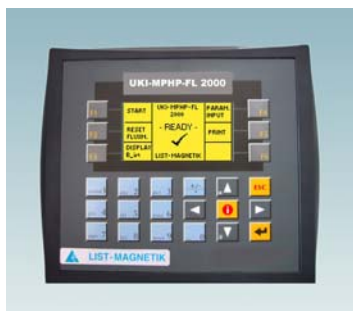
Operation Terminal UKI-MPHP

With our up-to-date field simulator software we are able to find the best solution for your application.