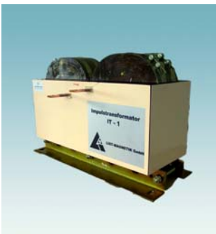
Pulse Transformer IT-1