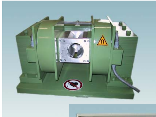
Yoke EM 6-J