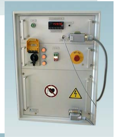
Pulse Generator IKS